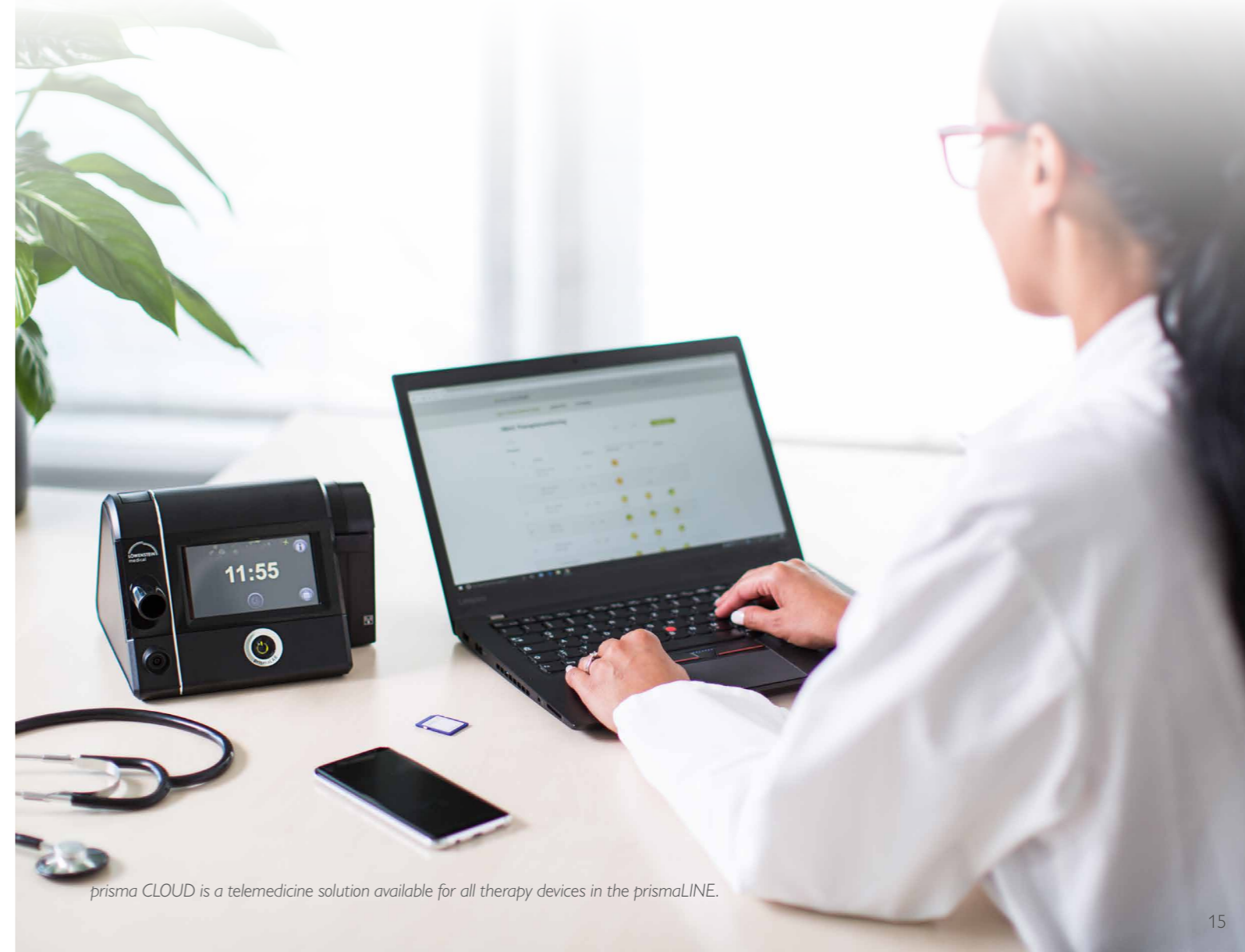
prisma CLOUD is a telemedicine solution available for all therapy devices in the prismaLINE.

Our administrators and algorithms continuously monitor prisma CLOUD for unusual activities or threats. We regularly make updates to keep our security concept prepared to deal with the changing dangers on the Internet. We invest time and effort in the protection of our customers' data because we want to maintain the same high quality standards for our digital products as for our therapy devices and software. For data protection and security have to be the top priority in the digitalization of the healthcare industry.