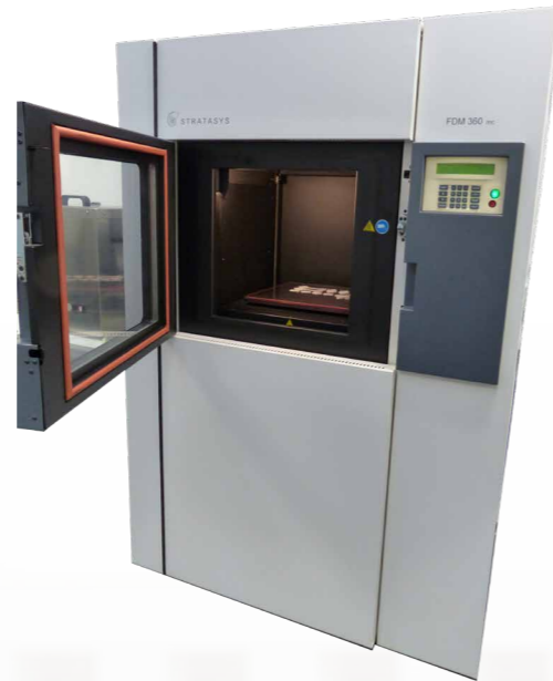
Professional 3-D printer for the production of functional models

If the Patient Interface Team members are satisfied, an aluminum form is milled in the Rapid Prototyping Center. This is a more time-consuming and expensive process, but it has the advantage of producing a surface that corresponds to a real mask cushion that can be worn by every patient throughout the night.