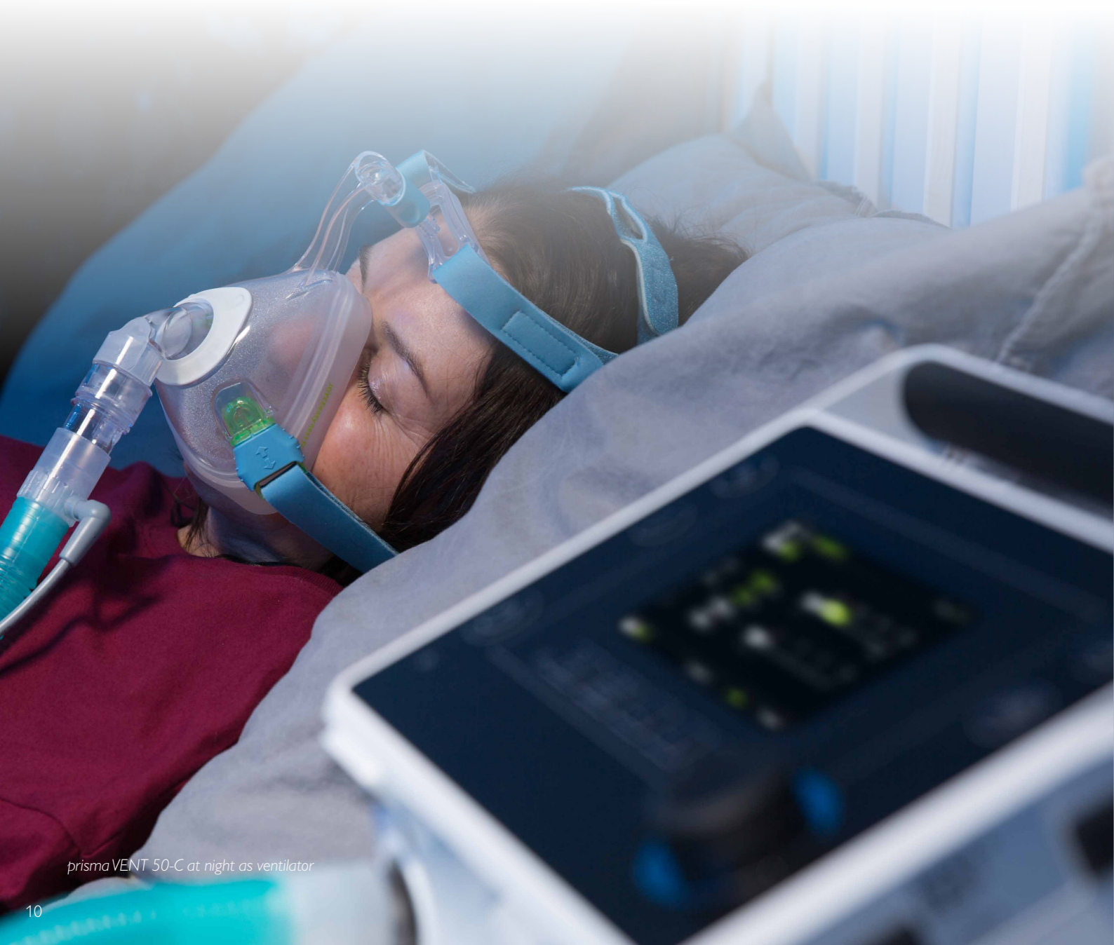
prisma VENT 50-C at night as ventilator

A unique treatment concept in the outpatient area is behind the therapy device prisma VENT50-C from Löwenstein Medical. For the first time ever, a single system can provide Non-Invasive Ventilation, Invasive Ventilation or High-Flow Therapy to accommodate the varied needs of patients during the day and at night. The less restrictive HFT can be used when the patient is awake. A switch is then made to ventilation when the patient sleeps as higher pressures are frequently required to keep upper airways open, something HFT cannot do. The patient can then follow a customized therapy plan without having to use different devices. Ultimately, that saves money. The high-performance humidifier prisma VENT AQUA can be used in both modes.