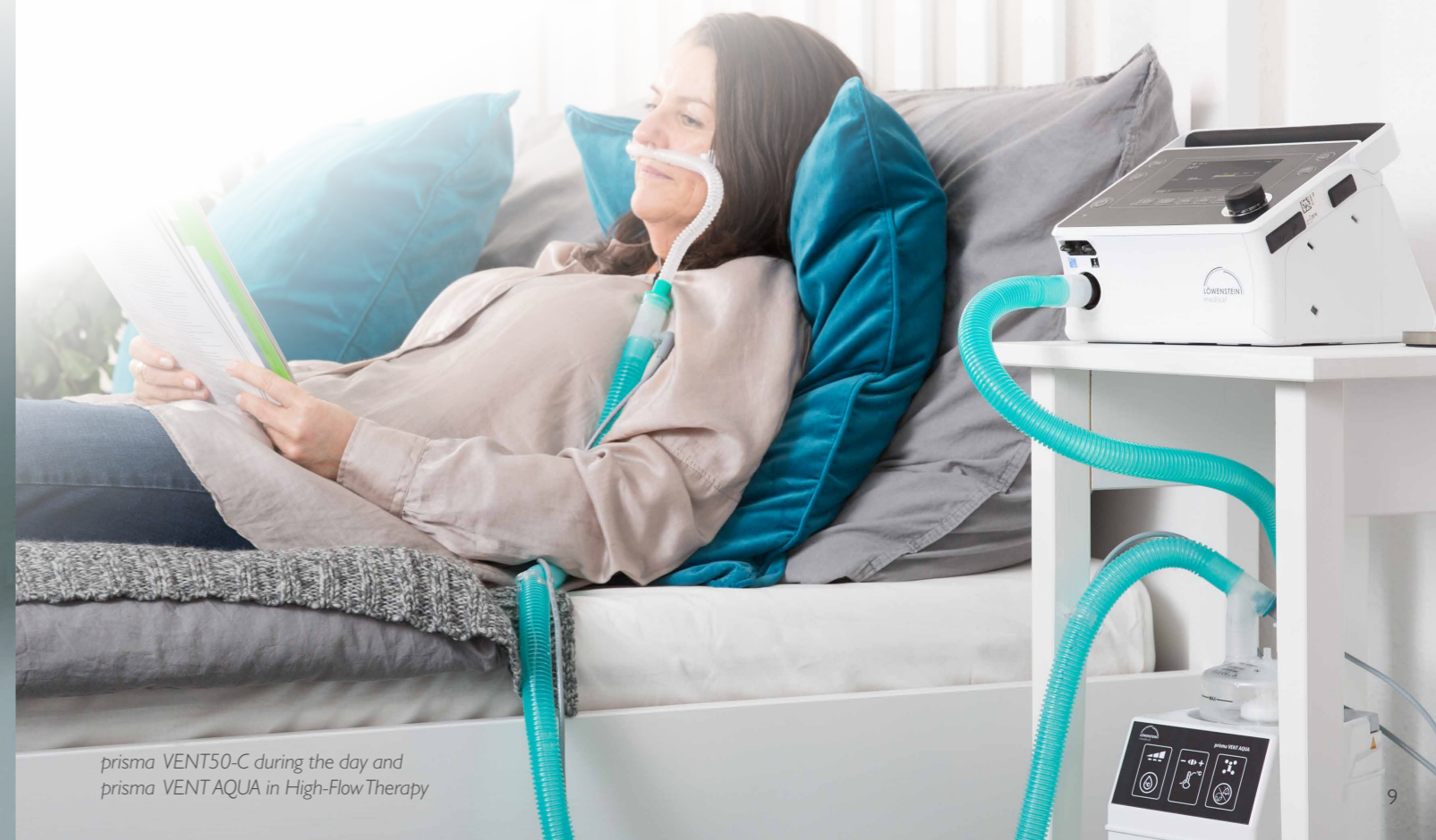
prisma VENT50-C during the day and prisma VENT AQUA in High-Flow Therapy