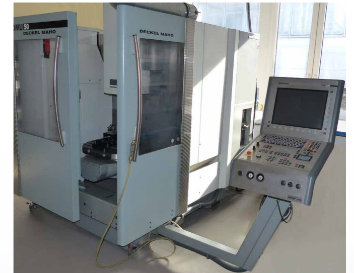
Milling machine for the production of aluminum forms

After about six to eight weeks the tests are completed and analyzed. The Patient Interface Team from Löwenstein Medical Technology will presumably repeat the tests many times until a new mask cushion is created that can satisfy the tough demands made by the highly diverse patients around the world.