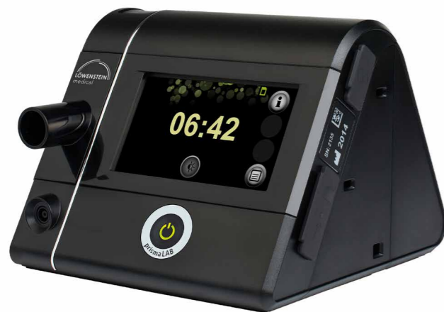
titration device prismaLAB

For even more flexibility, Sonata is equipped with two freely configurable ExG channels. Depending on the customer requirements, they can be defined for EEG, EOG, EMG or ECG tracings so that specific issues can be investigated.